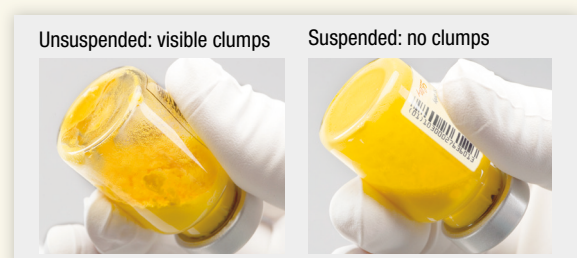
Figure 3: Check for unsuspended powder and repeat tapping if needed.